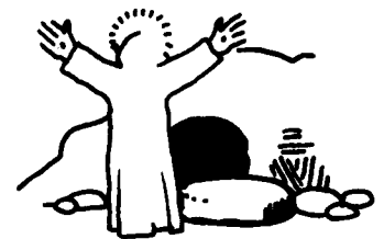
Jesus Rose Again!